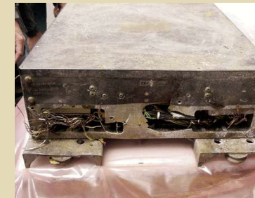
Just as computer models of reentry dynamics predicted, after Columbia broke apart, its flight data recorder (left) came down on a hillside in the eastern Texas town of Hemphill.

“For unprotected space hardware, the heating and loads will gradually tear it apart,” Ailor explained to the investigators during the hearing. “The kinds of things that we’ve seen that survive reentry are things that you would probably guess might—things like steel sometimes, glass, titanium, and then parts that are sheltered by other parts. One