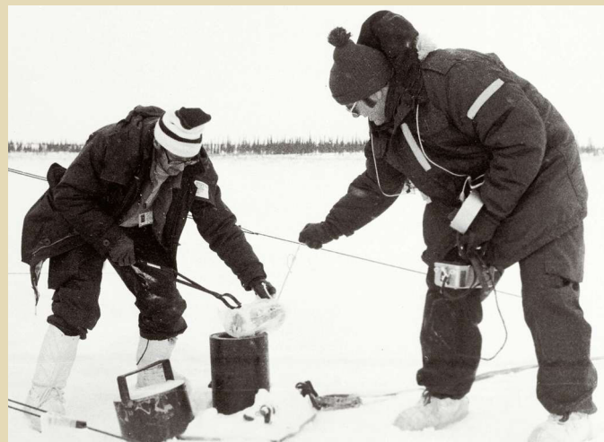
Authorities in northwestern Canada had the unpleasant task of gathering radioactive debris from Kosmos 954 , a Soviet nuclear-powered satellite that broke apart during reentry on January 24, 1978.