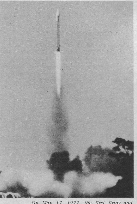
On May 17, 1977, the first firing and launch of an OTRAG rocket took place from a test range in central Africa.