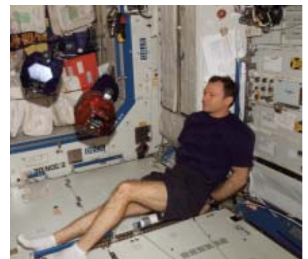
Mike Lopez-Alegria, commander of increment 14, was the prime oper ator for SPHERES test session five, and participated in test sessions seven and eight (eight sessions had been run as we went to press).

Launching an all-or-nothing fully designed space robot mission can fall far short of hopes if unexpected developments cannot be worked around (as with NASA's autonomous robot two years ago that was supposed to circle its target but instead rammed directly into it). In a technical paper presented at a recent Guidance,