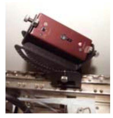
This "beacon" unit communicates with the SPHERES using ultrasound signals that plot position and speed.

The dozen small thrusters used spurts of pressurized gas to turn and shift position. When considering the design, one student fell back on a hobby of his and proposed using carbon dioxide cartridges from a paintball gun. The idea caught on, in large part because the devices were relatively low pressure (860 psi) and had already undergone significant safety reviews to qualify as air freight. A shorter cartridgesix inches long instead of nine inches—was custom manufactured by the vendor.